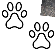
Arlo, Therapy Dog